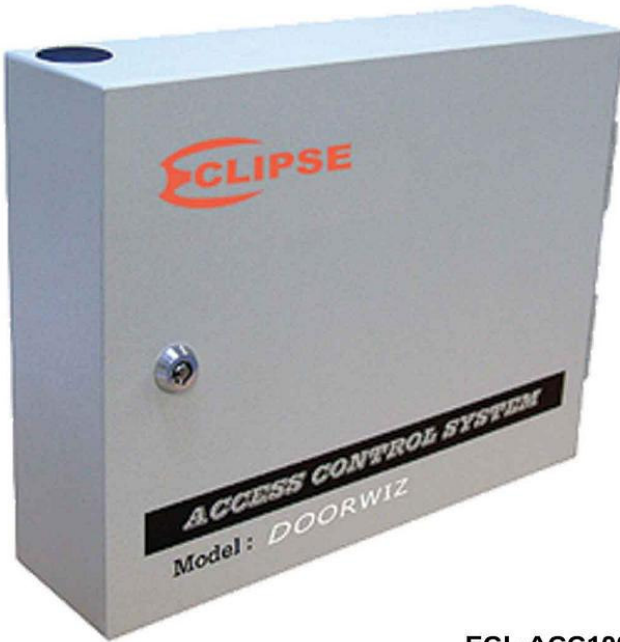
ECL-ACC1010 I/O Expansion 8 DI & 8 DO Board Ethernet Interface 10 Base-T (Optional)